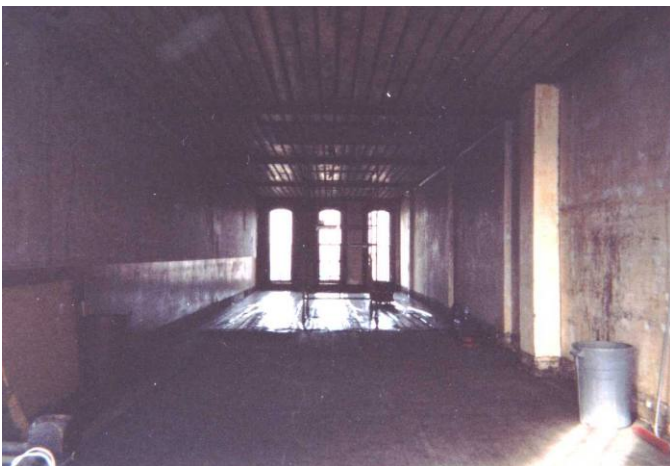
"Before" photo of second-floor space

*Code requires 1 hour fire rating on vertical exit enclosure; however, owner wanted to keep the stairs open. Code official allowed a single sprinkler head to be installed instead of the 1 hour fire enclosure.