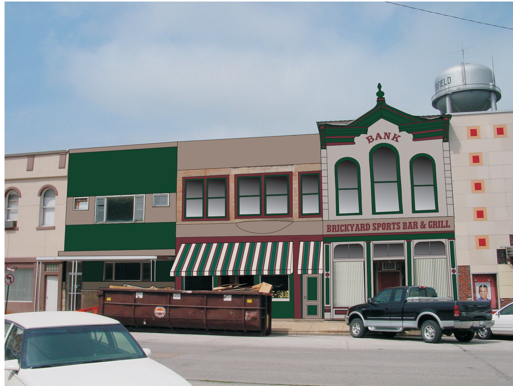
PROPOSED SCHEME 2