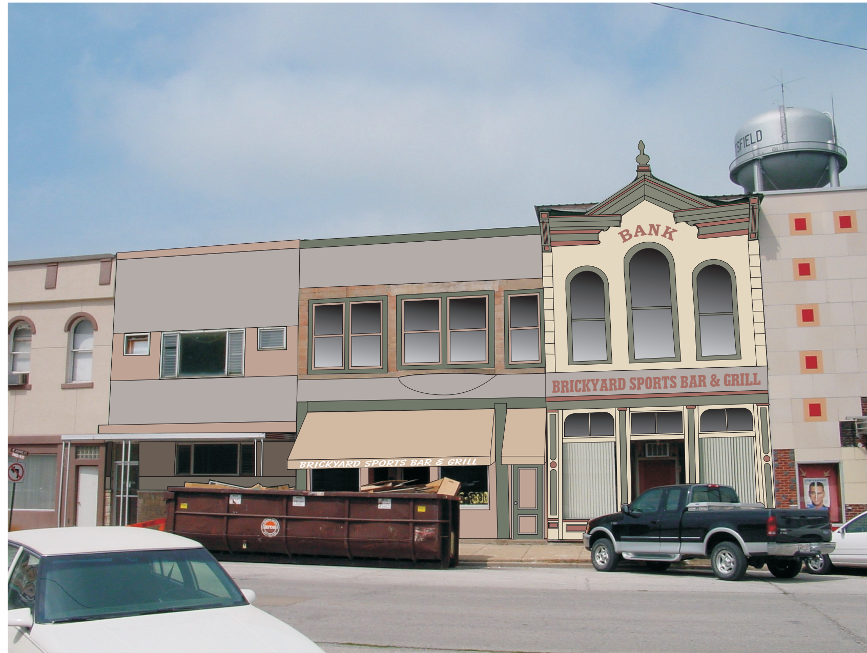
PROPOSED SCHEME 1