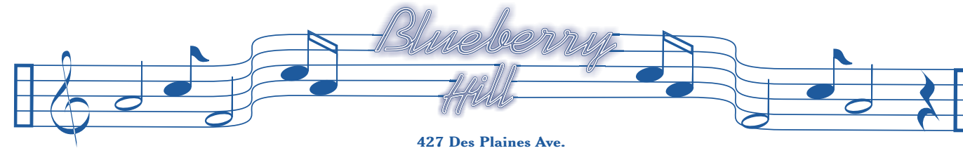
PROPOSED SIGN DESIGN