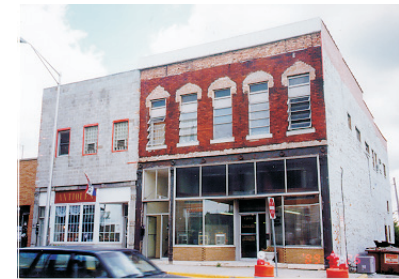
EXISTING CONDITION AS OF 9/99