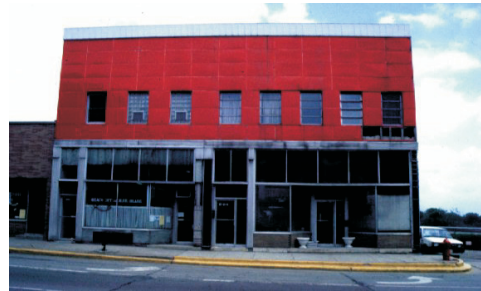
EXISTING CONDITION AS OF 5/97