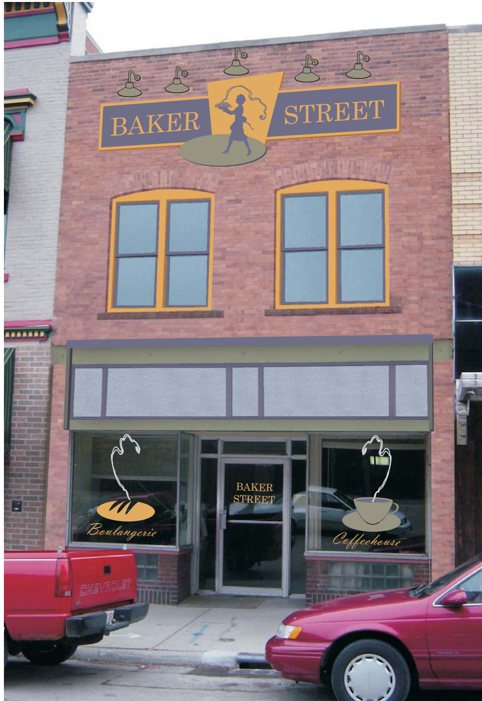
PROPOSED DESIGN WITH RETRACTED AWNING