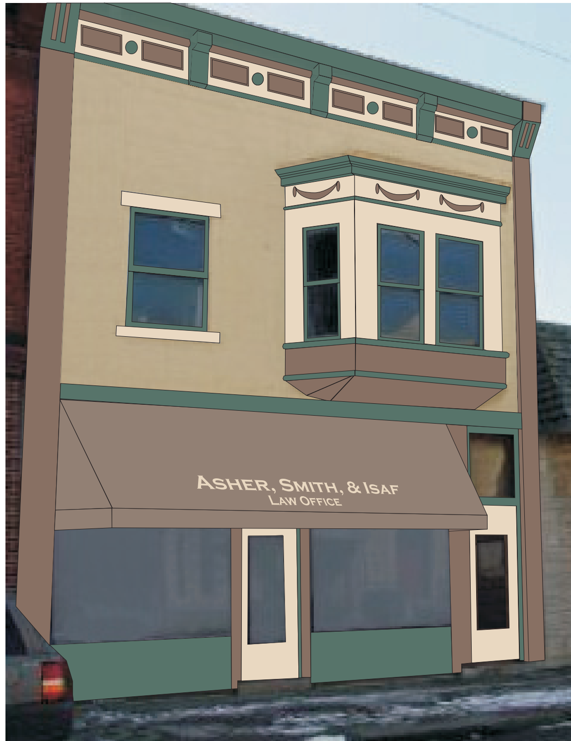
PROPOSED DESIGN WITH AWNING