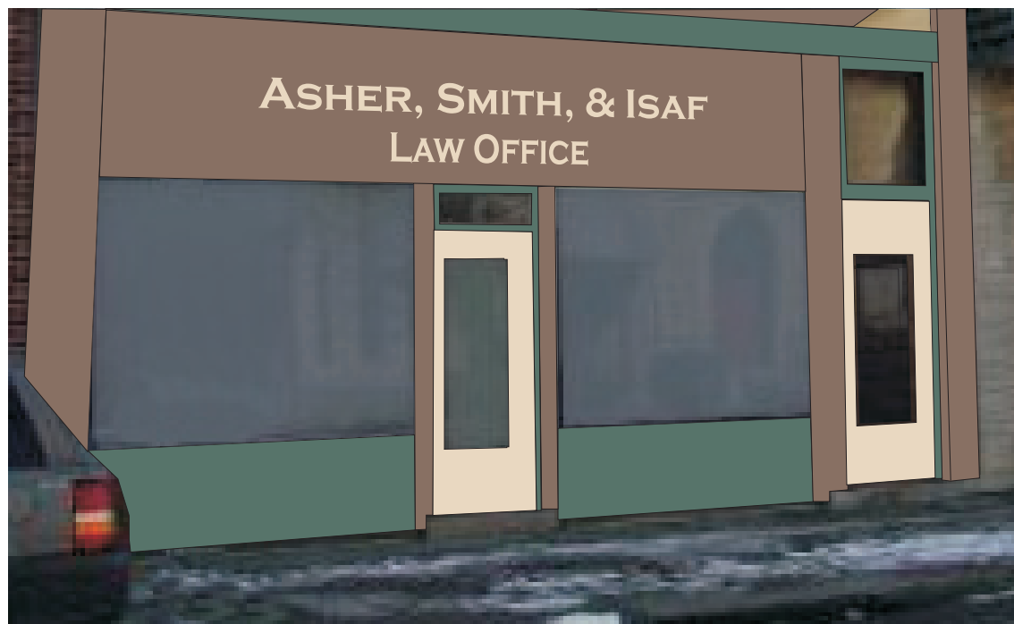
PROPOSED STOREFRONT DESIGN WITHOUT AWNING