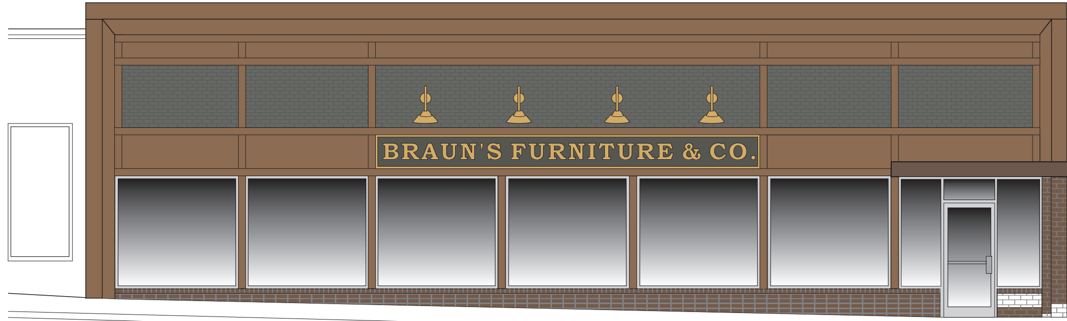
PROPOSED DESIGN 1

NOTE: The Illinois MAIN STREET Program, through the Illinois Historic Preservation Agency, has provided this free design assistance to qualified property/ business owners in the officially designated MAIN STREET project areas. The rendering on this sheet is a conceptual view of the facade renovation based on information supplied to the staff architect. Should obscured architectural details or problems be revealed during the work, the local project manager and/or the staff architect should be consulted.