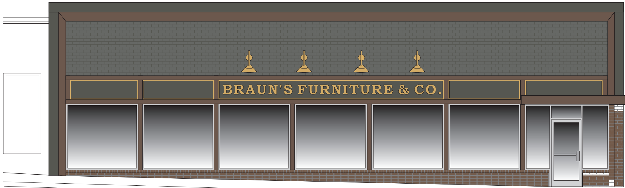
PROPOSED DESIGN 2