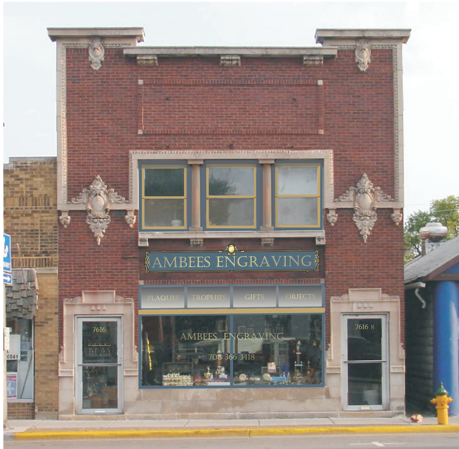
PROPOSED DESIGN WITH INTERNALLY LIT TRANSOMS