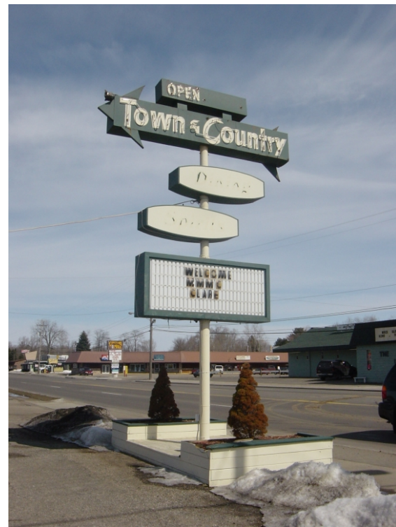
EXAMPLES OF MID-20TH CENTURY SIGNS

NOTE: The Illinois MAIN STREET Program, through the Illinois Historic Preservation Agency, has provided this free design assistance to qualified property/business owners in the officially designated MAIN STREET project areas. The rendering on this sheet is a conceptual view of the facade renovation based on information supplied to the staff architects. Should obscured architectural details or problems be revealed during the work, the local project manager and/or the staff architects should be consulted.