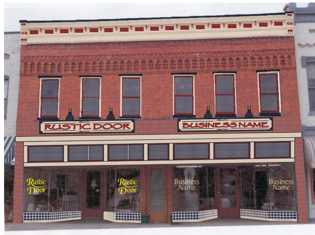
PROPOSED DESIGN WITHOUT CANOPY