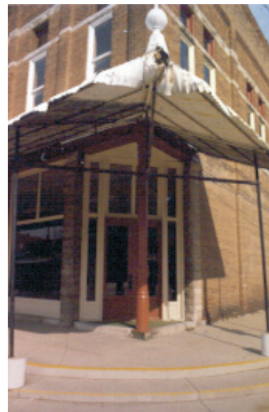
FIFE OPERA HOUSE PALESTINE, IL IRON STRUCTURE WITH CORRUGATED-STEEL SHEETS