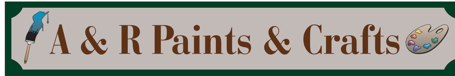
PROPOSED SIGN DESIGN