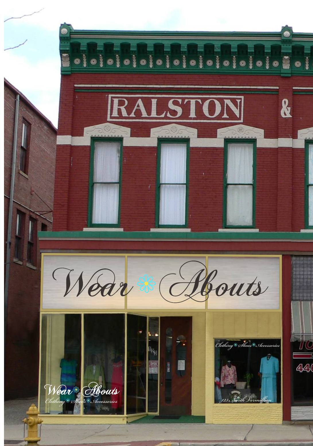
PROPOSED DESIGN WITH OBSCURE GLASS TRANSOM