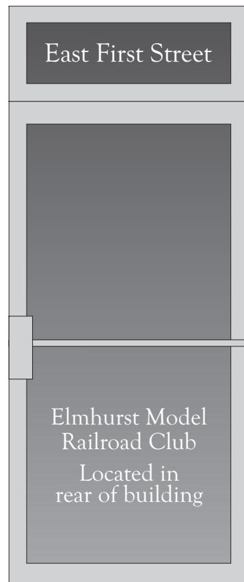
SUGGESTED WINDOW GRAPHICS