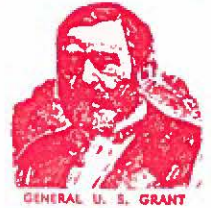
GENERAL U. S. GRANT

312½ North Main Street GALENA, ILLINOIS 61036 Telephone (815) 777-1050