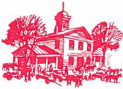
THE OLD MARKET HOUSE 1845