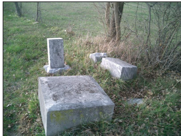
Morain Cemetery before clean up

Basic cemetery training involves elementary tasks such as documenting, washing, probing, and resetting certain types of markers.