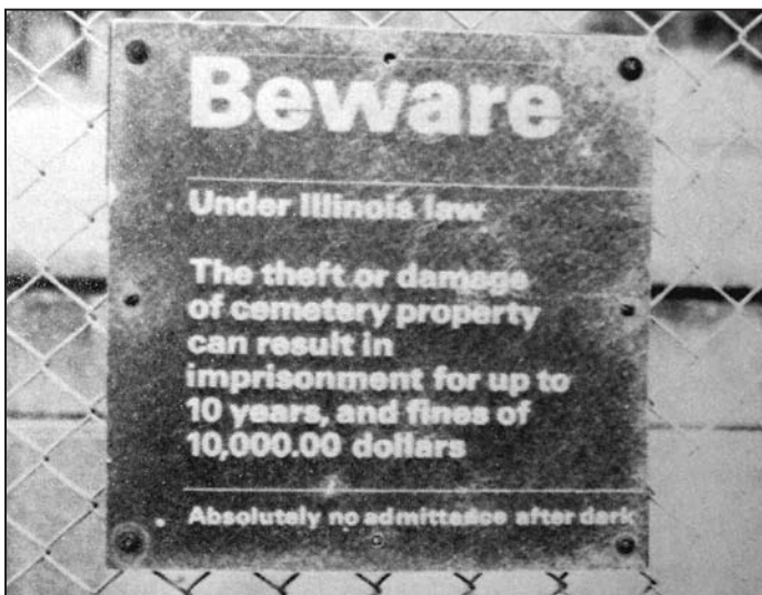
This notice presents a fair warning to visitors of this Sangamon County cemetery.

Public support can also be generated by the Illinois State Historical Society's marker program. That program oversees the erection of a historical marker to memorialize an event or person. The markers program may involve your local historical or genealogical society, a civic group, or anyone interested in the area's history. A historical marker may expand on the facts engraved on a grave marker, providing a brief biography of a significant local figure. For guidelines and an application, write: Illinois