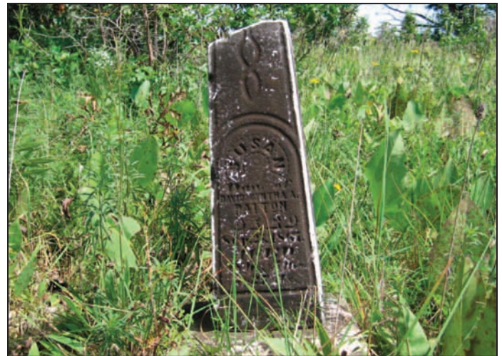
A pioneer plot in an Illinois Nature Preserve – Prospect Cemetery, Paxton, Ford County.

For additional information on nature preserves, their designation, and regulations, write: Illinois Nature Preserves Commission, Illinois Department of Natural Resources, One Natural Resources Way, Springfield, Illinois 62702.