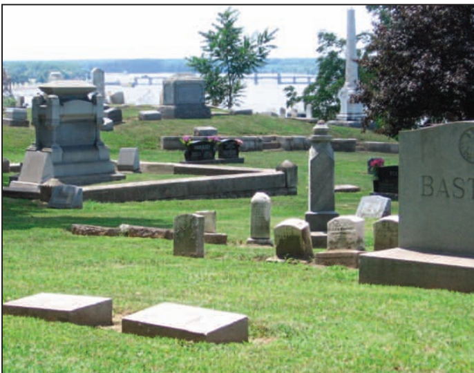
This is a well-maintained municipal cemetery in a park-like setting. Woodland Cemetery, Quincy, Adams County

Fraternal cemetery is a cemetery owned by a fraternal organization that limits its interments to members (760 ILCS 100/2).