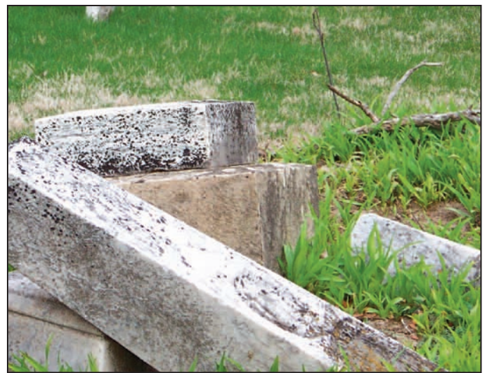
Under Illinois law, a county board can provide funds to clean and maintain a grave or cemetery, even if it is not owned by the county.