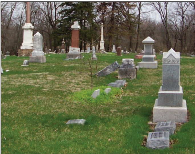
Cemeteries within a cemetery maintenance district may be reconditioned or restored with funds provided by the county government.

Vandalism takes many forms – discarded beer cans and trash, overturned monuments, graffiti, firearm damage, and so on. All are considered Class C misdemeanors. Operating motor vehicles in undesignated areas and at excessive speeds may also cause damage. Those violating the speed limit may be found guilty of a petty offense and fined. Cemetery associations may legally appoint police officers to protect