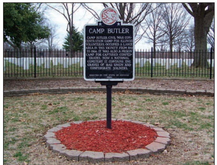
Historical markers memorialize an important person or event. The Illinois State Historical Society administers Illinois' marker program.