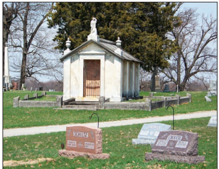
Cemeteries contain both above and below ground burials. Oak Hill Cemetery, Watseka, Iroquois County