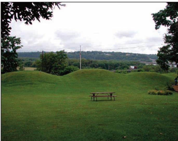
Prehistoric burial mounds, such as these, are protected by the Human Skeletal Remains Protection Act.

The review and compliance section monitors federal projects for their effect on historic places and cultural resources. Sometimes a federally funded highway route includes a cemetery in its right-of-way. Through the review and compliance process staff members may